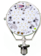
Yoke Application Available